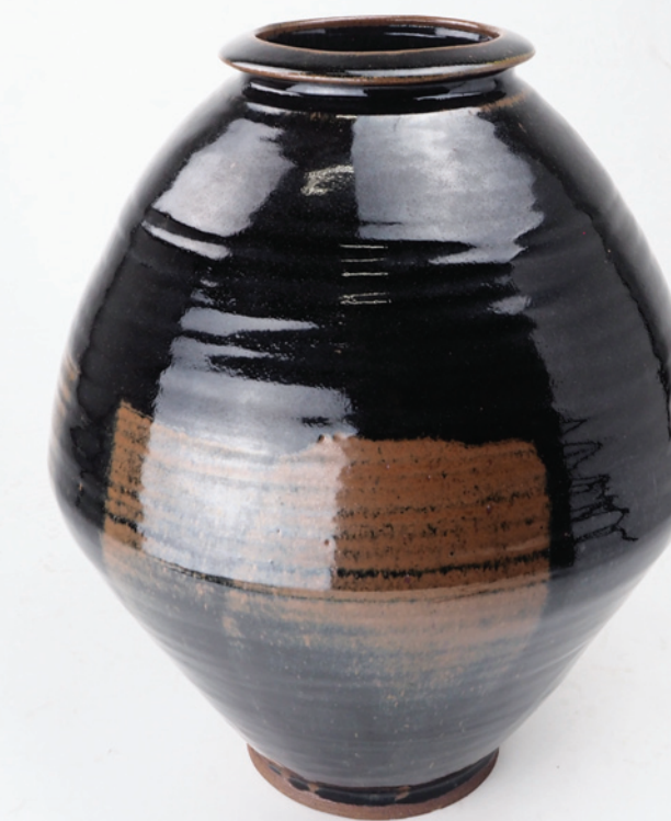
15. Nakazato Takashi 中里隆 (1937- ) Large Tenmoku Glazed Vase 天目釉壺 H17.7" x Dia13.3"