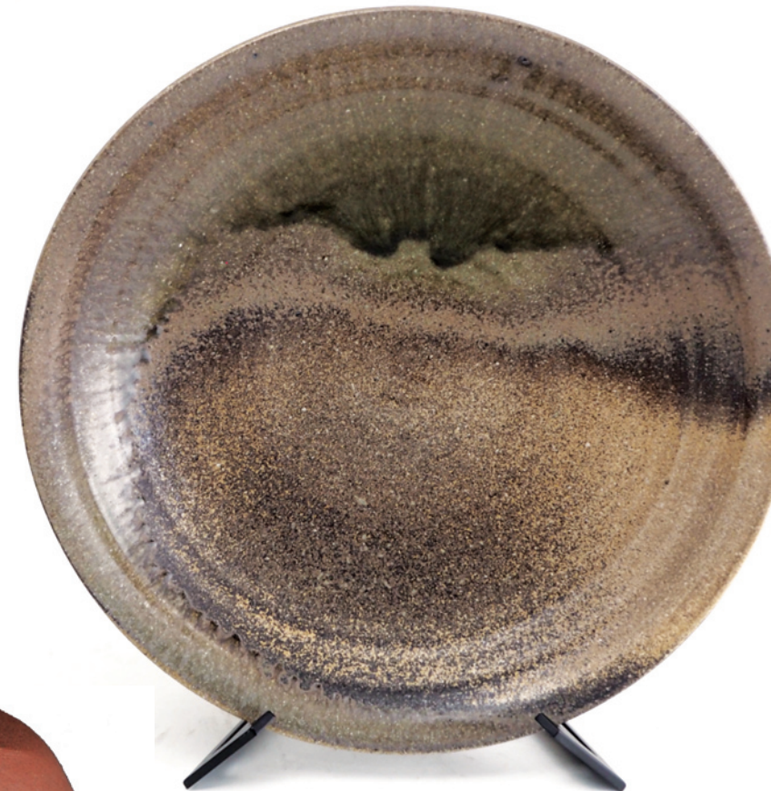
14. TAKEUCHI Kimiaki 竹内公明 (1948- ) Large Tokanome Plate 灰釉大皿 H2.4" x Dia17.1"