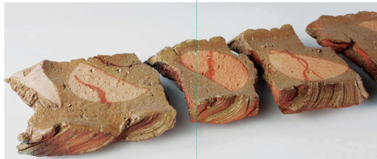
11. KAKUREZAKI Ryuichi 隠崎隆一 (1950- ) Bizen Four-part Platter 備前連器, 2009 L23.5" x W5"