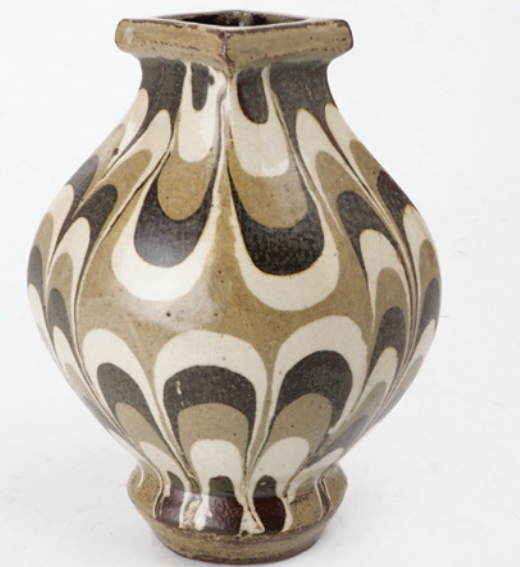
6. KAWAI Kanjiro 河井寛次郎 (1890-1966) Neriage style Flat Vase 練上壺扁壺 H10.4" x W10.4" x D5.7"