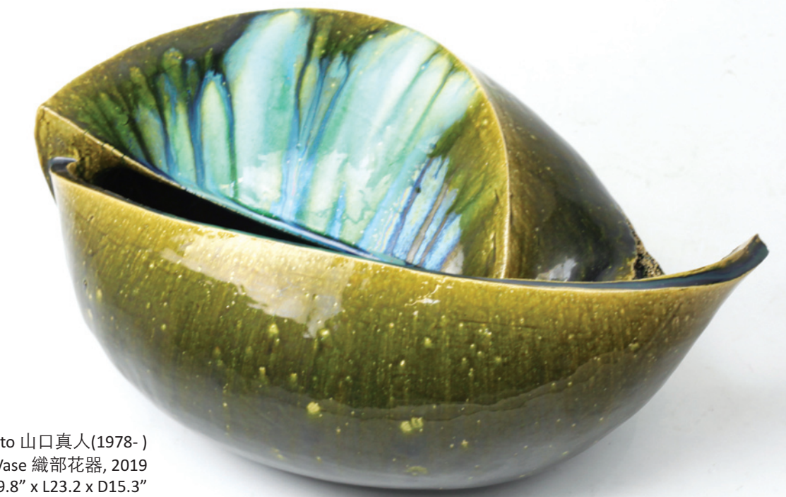
16. YAMAGUCHI Makoto 山口真人 (1978- ) Oribe Vase 織部花器, 2019 H9.8" x L23.2 x D15.3"