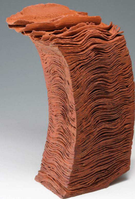
2. HIRUMA Kazuyo 昼馬和代(1947- ) Swing 揺らく, 2019 H19.2" x W12.7" x D5.5