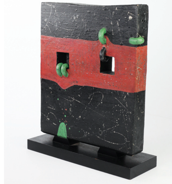
5. MORINO Taimai 森野泰明 (1934- ) Work 91-2 "Two Windows" 二ツの窓, 1991 H12.8" x W9.6"