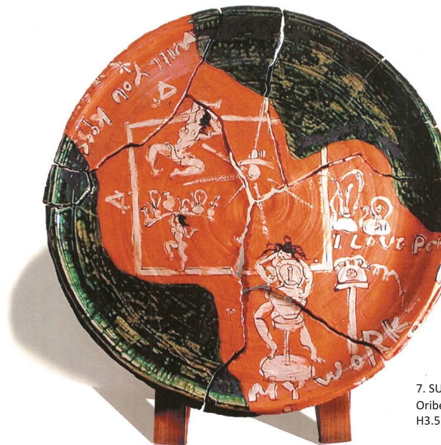
7. SUZUKI Goro 鈴木五郎(1941- ) Oribe Large Plate 織部大皿, circa2000 H3.5" x Dia41"