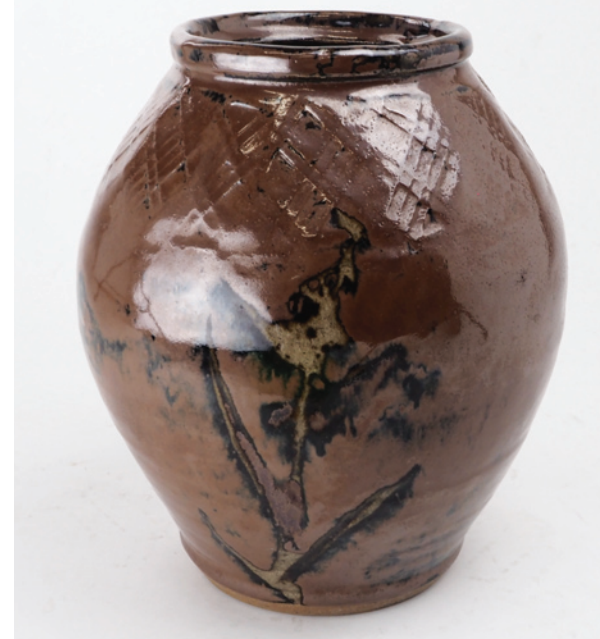
8. HAMADA Shoji 濱田庄司 (1894 - 1978) Persimmon Glazed and Iron Drawing Vase 柿釉紋打鐵繪花瓶 H12.1" x Dia 10.6"