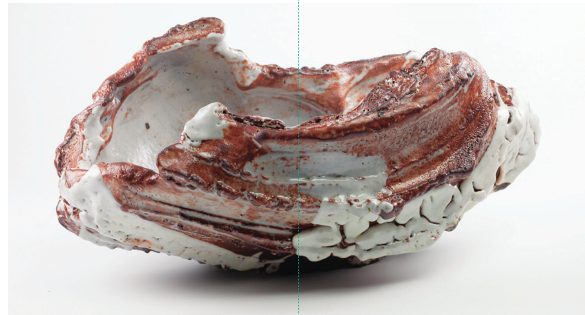
4. GOTO Hideki 後藤秀樹(1973- ) Shino Watatsumi 志野海神, 2019 H9" x W18.8" x D12.5"