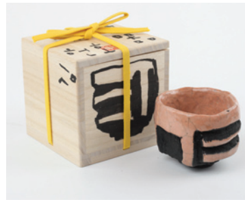
33. KIM Hono 金憲鎬(1958- ) Guinomi No. 4 H1.9" x Dia2.9" H5 x Dia7.4 cm