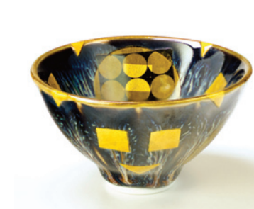
27. SUZUKI Hideaki 鈴木秀昭(1959- ) Sake Cup -Collage- 2 色絵金彩黒溪釉 コラージュ杯, 2020 H1.7" x Dia3" H4.5 x Dia7.8cm