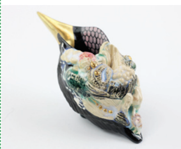
40. OISHI Sayaka 大石早矢香(1980- ) Hisui small pitcher black (Kingfisher) ひすい注器小 NO.5-1 H2.5" x W5.3" x D1.9" H6.5 x W13.5 x D5cm