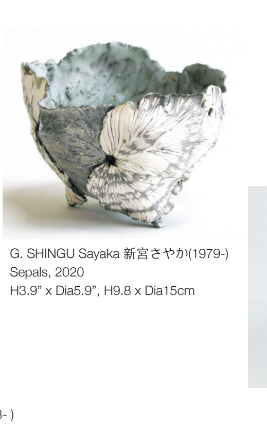
G. SHINGU Sayaka 新宮さやか(1979-) Sepals, 2020 H3.9" x Dia5.9", H9.8 x Dia15cm