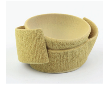
12. MATSUTANI Fumio 松谷文生(1975- ) OH guinomi d-1 黄盃 H1.9" x W3.5" x D2.75" H5 x W9 x D7cm