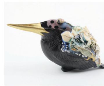
6. OISHI Sayaka 大石早矢香(1980- ) Hisui small pitcher black (Kingfisher) ひすい注器小 NO.5-2 H2.5" x W5.3" x D1.9" H6.5 x W13.5 x D5cm