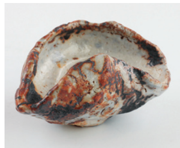
34. GOTO Hideki 後藤秀樹(1973- ) Gray Shino Guinomi No.3 鼠志野貝盃, 2020 H2.3" x W4.1" x D3.1" H6 x W10.5 x D8cm