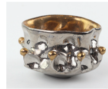
21. ISHIYAMA Tetsuya 石山哲也(1973- ) Gold and Silver Milk Crown Guinomi 金白金隆粒酒盃 H1.9" x W2.8" x D3" H5 x W7.2 x D 7.7cm