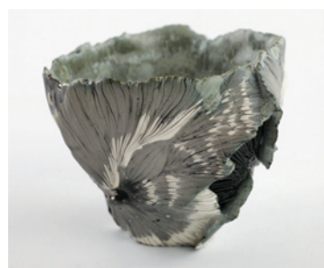
35. SHINGU Sayaka 新宮さやか(1979- ) Guinomi-#2 Sepals, 2020 H2.5" x Dia3.1" H6.5 x WDia8cm