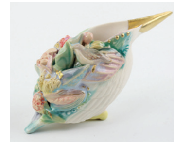
18. OISHI Sayaka 大石早矢香(1980- ) Hisui small pitcher (Kingfisher) ひすい注器小 NO.4-1 H2.5" x W5.3" x D1.9" H6.5 x W13.5 x D5cm