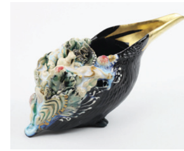
28. OISHI Sayaka 大石早矢香(1980- ) Hisui-pitcher (Kingfisher) ひすい注器 3, 2020 H3.9" x W9" x D3.1" H10 x W23 x D8cm