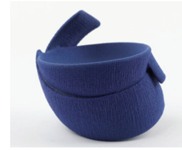
17. MATSUTANI Fumio 松谷文生(1975- ) SOU Guinomi d-4 蒼盃 H2.9" x W3.2" x D3.1" H7.4 x W8.2 x D7.9cm