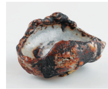
26. GOTO Hideki 後藤秀樹(1973- ) Gray Shino Guinomi No.1 鼠志野貝盃, 2020 H2.55" x W3.9" x D3.3", H6.5 x W10 x D8.5cm