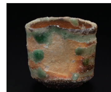
15. KOHARA Yasuhiro 小原康裕(1954- ) Shigaraki Guinomi O ぐい呑, 2020 H2.75" x W2.75" x D2.55" H7 x W7 x D6.5cm