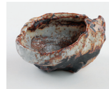
24. GOTO Hideki 後藤秀樹(1973- ) Gray Shino Guinomi No.6 鼠志野貝盃, 2020 H2.55" x W3.9" x D3.3", H6.5 x W10 x D8.5cm