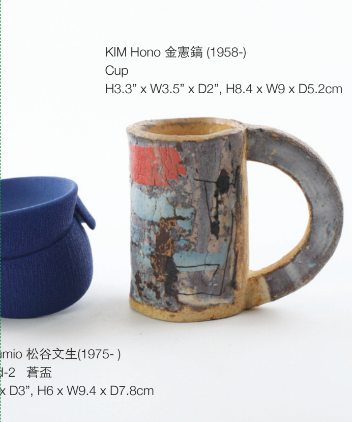
KIM Hono 金憲鑄 (1958-) Cup H3.3" x W3.5" x D2", H8.4 x W9 x D5.2cm