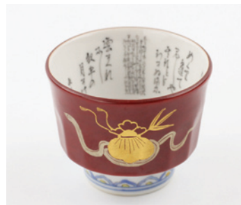
4. TAMURA Keisei 田村敬星(1949- ) Micro Calligraphy Sake Cup Snake 毛筆細字盃 巳 H1.6" x Dia2.3" H4.3 x Dia5.8cm