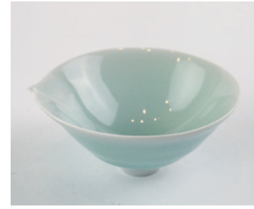
7. FUKAMI Sueharu 深見陶治(1947- ) Porcelain Guinomi H 1.3" x 3.3" H3.5 X Dia 8.4cm