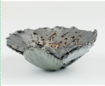
38. SHINGU Sayaka 新宮さやか(1979- ) Guinomi-#4 Lotus petals, 2020 H1.6" x Dia 4.1" H4.2 x Dia10.5cm