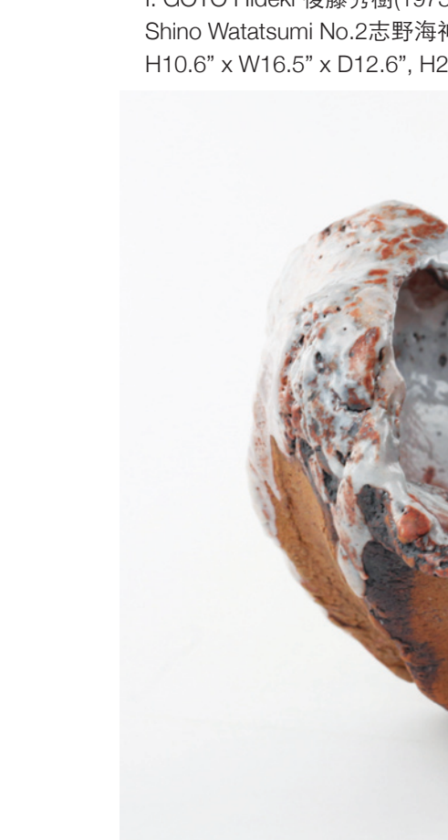
I. GOTO Hideki 後藤秀樹(1973- ) Shino Watatsumi No.2志野海神, 2020 H10.6" x W16.5" x D12.6", H27 x W42 x D32cm