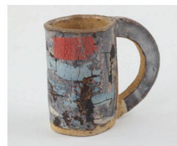
10. KIM Hono 金憲鎬(1958- ) Cup H3.3" x W 3.5" x D2" H8.4 x W 9 x D 5.2 cm