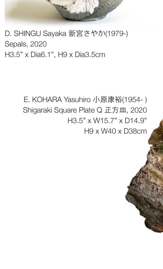
D. SHINGU Sayaka 新宮さやか(1979-) Sepals, 2020 H3.5" x Dia6.1", H9 x Dia3.5cm