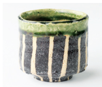
5. SAWA Katsunori 澤克典(1980- ) Oribe Sake Cup Stripe 1 織部ぐい呑 1, 2020 H2.1" x Dia2.2" H5.4 x Dia5.6cm