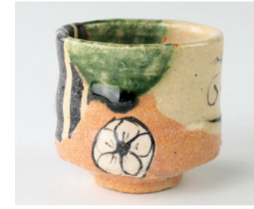
22. SAWA Katsunori 澤克典(1980- ) Oribe Sake Cup 4 織部ぐい呑 4,2020 H2" x Dia2.2" H5.3 x Dia5.8cm