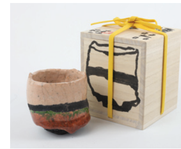
16. KIM Hono 金憲鎬(1958- ) Guinomi No.3 H3.1" x Dia 2.9" H8 x Dia 7.5 cm