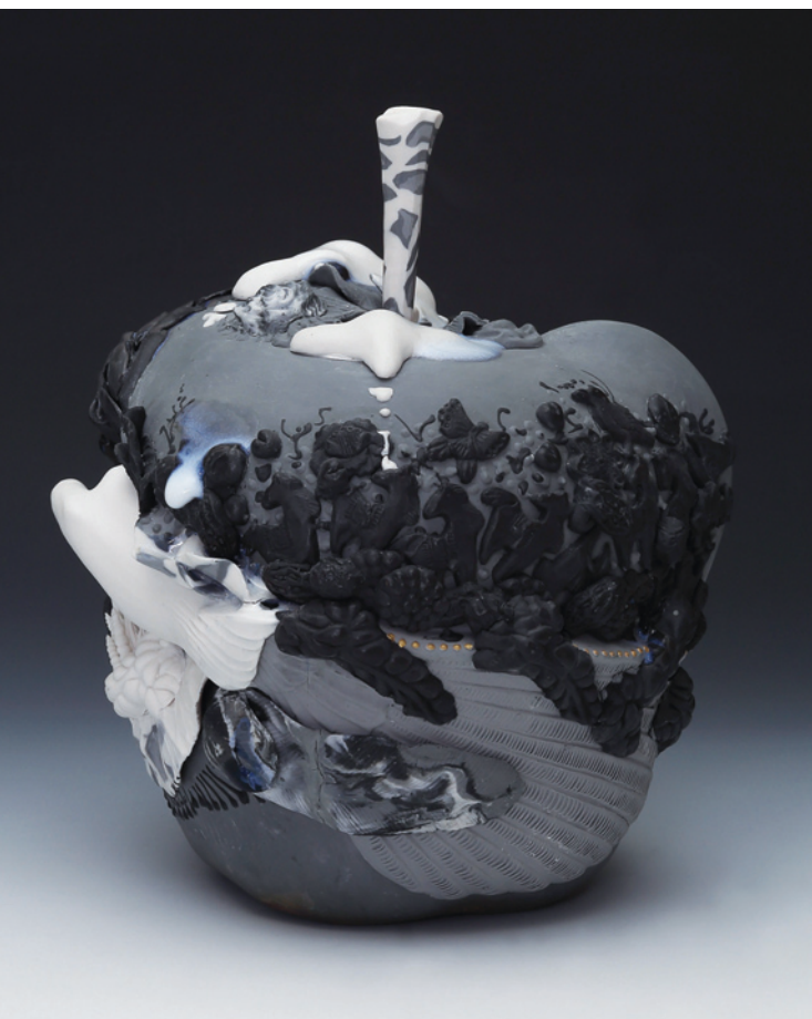
B. OISHI Sayaka 大石早矢香(1980- ) Sensitive Apple -black-, 2019 H7" x W6.7" x D7.4", H18 x W17 x D19cm

The aesthetics of Tea have persisted in Japanese culture. The humble is elevated. Simplicity, even roughness, are celebrated. Beauty is found in both perfection and imperfection. Today, useful wares, such as guinomi (sake cup) and Yunomi (drinking cup) are carefully considered in terms of form and function. The wide mouth of a sake cup brings more aroma to the nose. Cold sake calls for thin porcelain; thick yakishime is the choice for warm sake. Some collectors choose to focus on guinomi, and Yunomi which are affordable, easy to store and bring artfulness to the everyday.