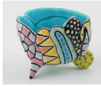
2. SHIBATA Masamitsu 柴田雅光(1961- ) Sky Blue pop bowl H2.3" x D 3.2" H 6 x Dia 8.2 cm