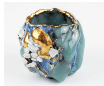
9. ICHIKAWA Toru 市川透(1973- ) 青磁ぐい呑 Sake Cup Resilience No.8 H2.75" x Dia2.75" H7 x Dia7cm