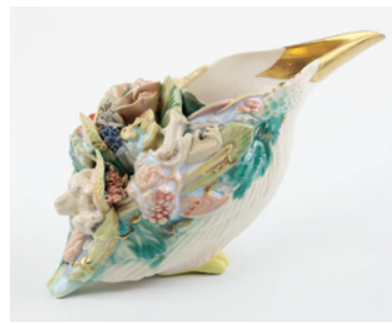
31. OISHI Sayaka 大石早矢香(1980- ) Hisui-pitcher (Kingfisher) ひすい注器 1, 2020 H4.1" x W9.4" x D3.1" H10.5 x W24 x D8cm