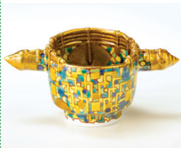
39. SUZUKI Hideaki 鈴木秀昭(1959- ) Sake Cup -cosmic- 3 色絵金彩銀彩cosmic杯, 2020 H1.8" x W3.9" x D2.3" H4.7 x W10 x D6cm