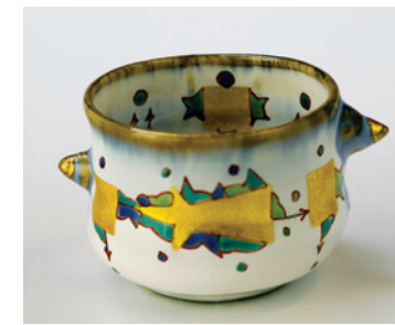
11. SUZUKI Hideaki 鈴木秀昭(1959- ) Sake Cup -cutie- 5 色絵 彩乳白釉cutie杯, 2020 H1.5" x D2.5" x D2" H4 x D6.5 x D5.2cm