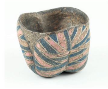
8. TAKEUCHI Shingo 竹内真吾(1955- ) Inlaid Guinomi 象嵌ぐい呑 No.1 H2.1" x Dia2.75" H5.5 x Dia7cm