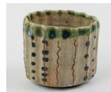
20. KOYAMA Tomonori 小山智徳(1953- ) Oribe guinomi H1.9" x Dia 2.1" H 5 x Dia 5.5 cm