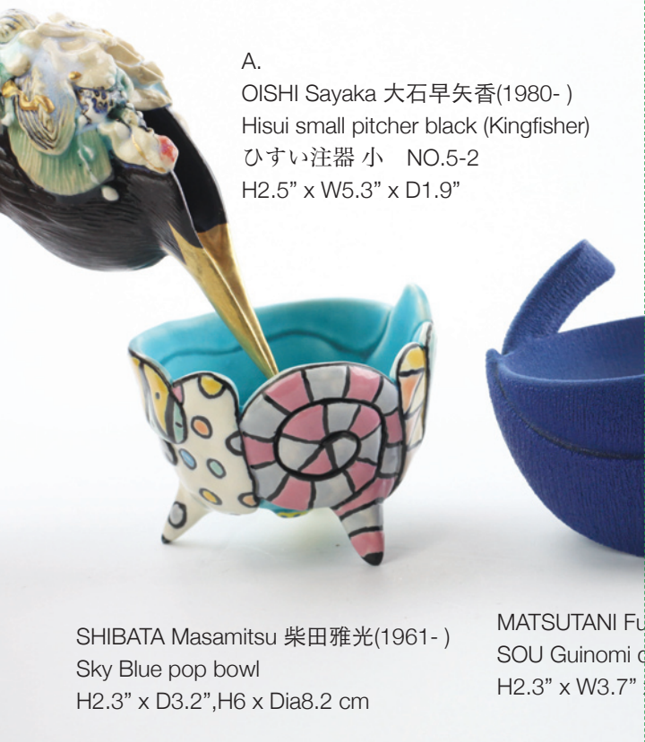
A. OISHI Sayaka 大石早矢香(1980- ) Hisui small pitcher black (Kingfisher) ひすい注器 小 NO.5-2 H2.5" x W5.3" x D1.9"