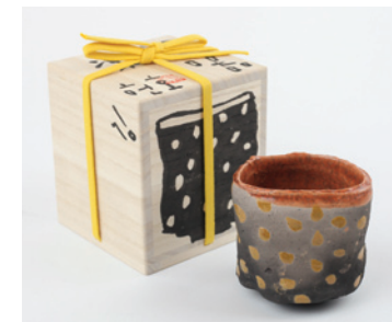
29. KIM Hono 金憲鎬(1958- ) Guinomi No.2 H2.9" x Dia 3.1" H7.5 x Dia 8 cm