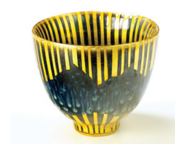
25. SUZUKI Hideaki 鈴木秀昭(1959- ) Sake Cup -Stripe- 1 色絵金彩黒溪釉縞杯, 2020 H2.3" x Dia2.6" H6 x Dia6.8cm