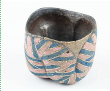
37. SAWA Katsunori 澤克典(1980- ) Oribe Sake Cup Stripe 1 織部ぐい呑 1, 2020 H2.1" x Dia2.2" H5.4 x Dia5.6cm